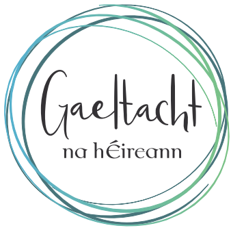
Full Logo - B&W option 2 - On Light Background