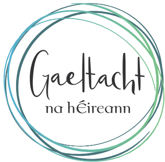
Full Logo - 4 colour option 2