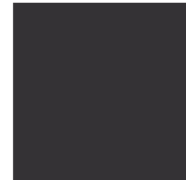
Warm Grey C75 M70 Y65 K50 R53 G52 B55 HEX: 343436