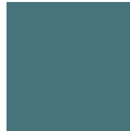
Teal C75 M42 Y45 K12 R72 G116 B123 HEX: 47747a